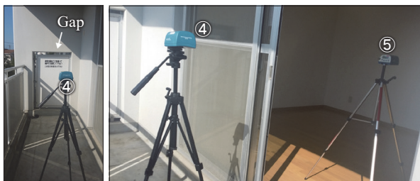
Figure 2. Measurement of PM_{2.5} on the neighboring veranda and inside the room on the same floor.