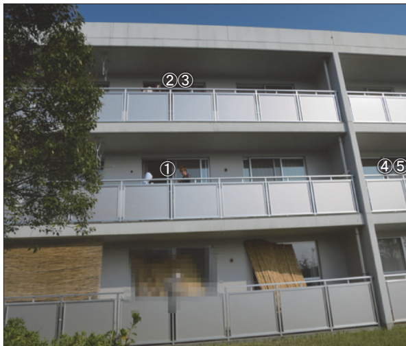
Figure 1. External appearance of the apartment and the five measurement points of fine particulate matter ( PM_{2.5} ).

Experimental measurement was done using the second and the third floors of a typical 3-floor apartment house (Figure 1) in October 2015. We used five digital dust monitors (TSI, Sidepak, AM510). Figure 2 shows the situation of the measurement in a typical apartment house in Japan. Five dust monitors were set up, as